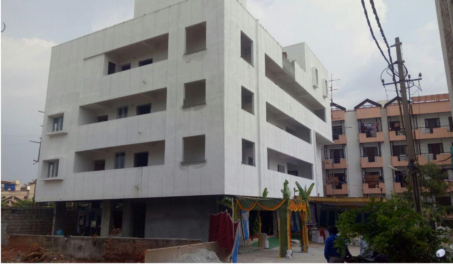
Mr Srivatsa's residence Building at Malleshwaram (under constructions)(Architect: Studio Happy Mind)